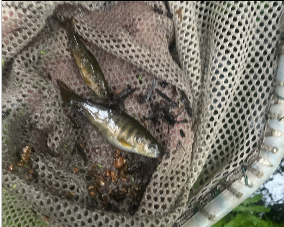
Figure 1.—Juvenile coho salmon captured at waypoint 1531.