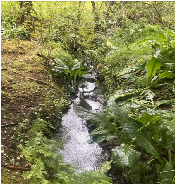
Figure 2.—Channel upstream of waypoint 1531.