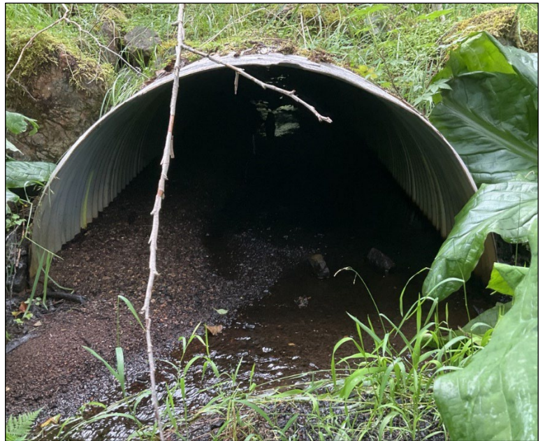
Figure 3.—Culvert outlet at waypoint 1312.